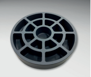
Silicon Nitride (SN240)