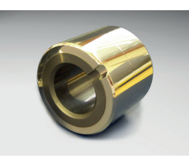
Shrink fit ceramic in metal housing

Male bearing made of silicon carbide StarCeram<sup>©</sup> SSiC