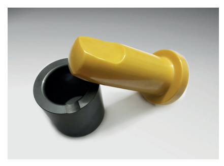
Female bearing made of silicon carbide StarCeram<sup>©</sup> SSiC, male bearing made of zirconium oxide FZM